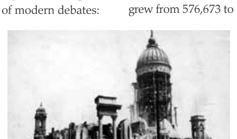
SAN FRANCISO CITY HALL AFTER 1906 EARTHQUAKE

that the predictive science was uncertain and ambiguous, that imposing regulation was a hindrance to the economy, that raising awareness of the risk was politically motivated, and that the fear of risk was a greater problem than the risk itself. None of the stakeholders in the dispute acted with complete integrity. Each manipulated and