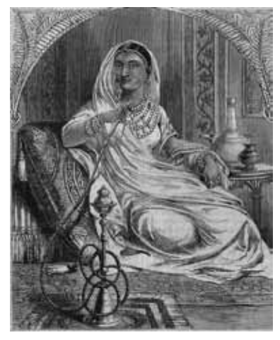
THE RANI OF JHANSI

Queen Elizabeth I signed a charter in 1660 granting the "Governor and Company of Merchants of London trading into the East Indies," a monopoly on all English trade to the east of the Cape of Good Hope. This company of merchants, commonly known as The East India Company, established its earliest trading posts in India during the seventeenth century at a time when the power and opulence of the reigning Mughal court was legendary. By the eighteenth century, however, this once formidable Mughal Empire had disintegrated. Former petty rulers and chieftains, taking advantage of the situation, established power in numerous native states. The East India Company formed alliances with several of these local Indian rulers. They provided military protection to the rulers from their neighbors; in return they retained their right to trading profits and local land revenue collection,